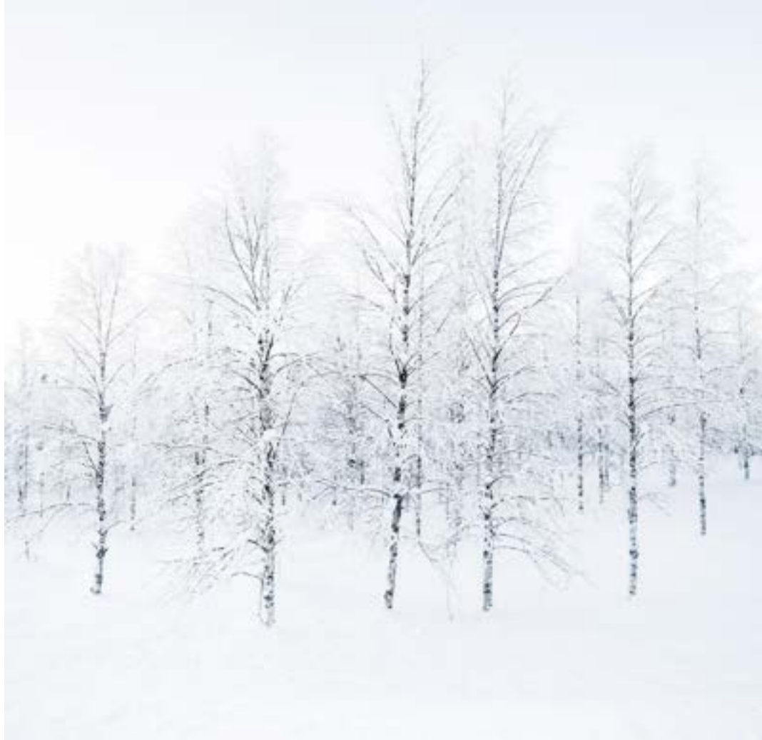
Left: Primary Bottom: Loch Ba Lifting Mist Right: Peaceful Jean-Michel Lenoir © Taunus Foto Galerie. All rights reserved.